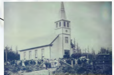
# 1 Camano Lutheran Church 1904 850 Heichel Road Open Sunday & check at office