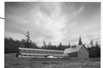
# 3 Kristoferson Farm 1912 332 North East Camano Dr. Open daily