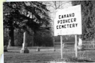
# 2 Pioneer Cemetery 557 East North Camano Dr.