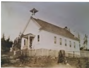
# 9 Camano City Schoolhouse 1906 993 Orchid Road Open for special events