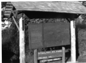
# 10 Utsalady Vista Point 398 Shore Dr. Day use park