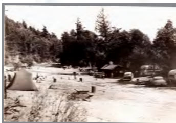
#6 Camano Island State Park 1949 2269 Lowell Point Rd Open daily dawn to dusk