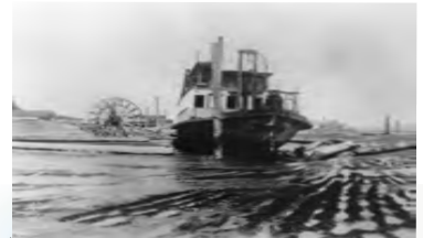
# 12 English Boom, E.G.English steam tug abandoned 1945 North end of Moore Rd.

Camano is located 7 miles off I-5, Exit 212, at the west end of SR 532