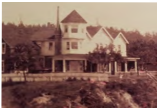
#8 Camano Island Inn 1923 1054 South West Camano Drive Open daily