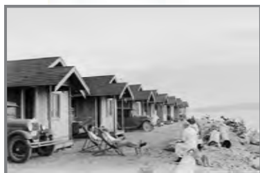
#7 Cama Beach Historical State Park 1934 1880 South West Camano Drive Open daily dawn to dusk