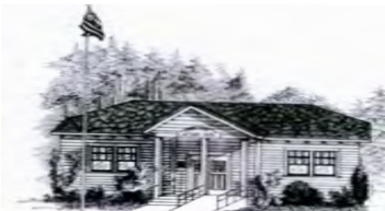
#11 Utsalady Ladies Aid 1908 79 Utsalady Rd Open for special events