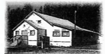
# 4 South Camano Grange 1930 2227 South Camano Dr. Open for special events