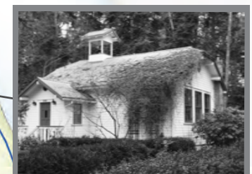
#5 Mabana Schoolhouse 1916 3648 South Camano Dr. Privately Owned Open for special events