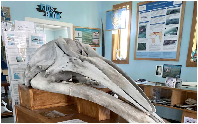
Juvenile gray whale skull on display in the baleen whale exhibit.

The Whale Center docents offer insights into the behaviors of different types and families of Orcas; as well as Gray whales, Minke whales, Humpbacks, and other Puget Sound marine life. Examine bones and baleen or listen to the incredible calls of these fascinating animals with The Ocean Listening Exhibit. A welcoming Kids Room with ocean murals introduces youngsters to this important topic, and the gift shop is laden with adorable toys and beautiful artwork.