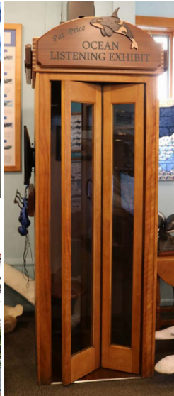
TOP: Replica of a juvenile orca skull. BOTTOM: Langley Whale Center street view. RIGHT: Pat Price Ocean Listening Exhibit—a unique underwater listening experience for visitors.