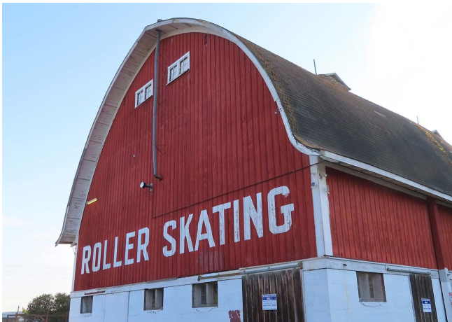
ABOVE: The Roller Barn as it appears today. TOP RIGHT: Neil Barn under construction in 1912. RIGHT: The “Windmill” water tower, which was never actually a windmill.

This barn has lived many lives though. Upon its completion a grand barn-warming was held, with an orchestra brought by boat from the mainland. After a few decades serving as a dairy, the barn was restored and refitted as a skating rink in